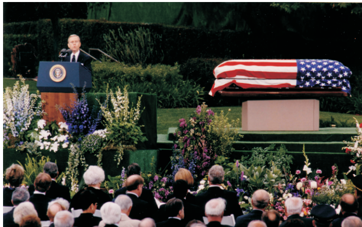
Wilson delivering the eulogy at Nixon's funeral