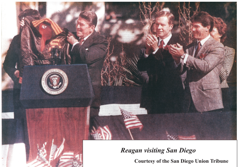
Reagan visiting San Diego

Loyalty is a continuing theme in the political career of Pete Wilson. It was challenged in 1976 when Ronald Reagan opposed the nomination of his fellow Republican, President Gerald Ford. Wilson, to the surprise of many Californians, did not support Reagan. While the decision prompted the Reagan zealots to assail Wilson, and it was not the politic thing to do for